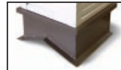
1/12-12/12 optional pitch special order